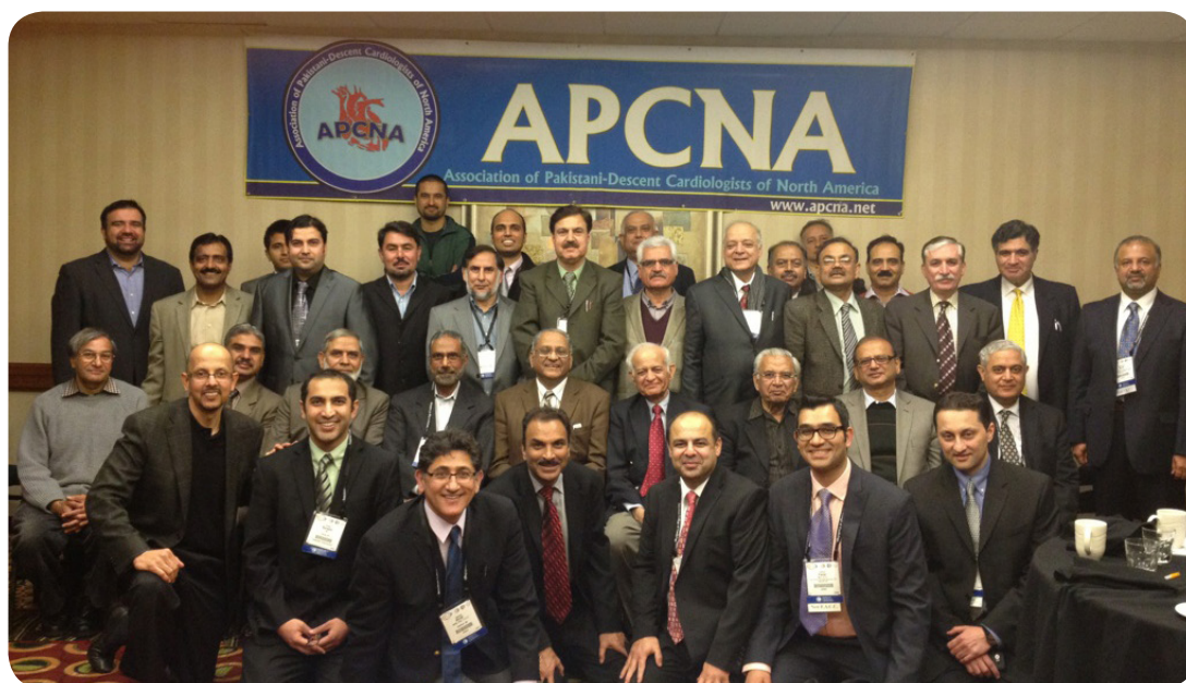
APCNA members attending this year’s ACC Convention in San Francisco

Further information about our pacemaker project can be obtained from www.apcna.net . For further information on “My Heart Your Heart project” please visit http://www.med.umich.edu/myheartyourheart/ .